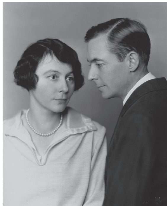
Dorothy and DuBose Heyward in 1927

Porgy and Bess first began as the novel, Porgy , written by DuBose Heyward in 1925. A descendant of Thomas Heyward, Jr., who was a signer of the United States Declaration of Independence as a representative of South Carolina, DuBose became a Charleston insurance and real-estate salesman with a long-standing and serious interest in literature. He became financially independent and abandoned his business to devote full time to writing.